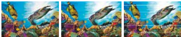
Incorrect bi-directional drop landing position Overlap / black streaks (Insufficient paper feeding) Gap / white streaks (Excessive paper feeding)

* DAS may not be compatible with some media such as coloured, transparent, and embossed substrates.